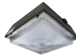
Low Profile (ETL/cETL DLC PREMIUM)