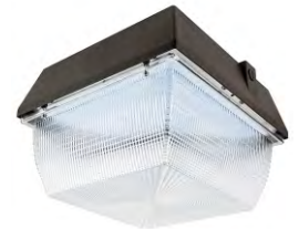
High Profile (ETL/CETL)