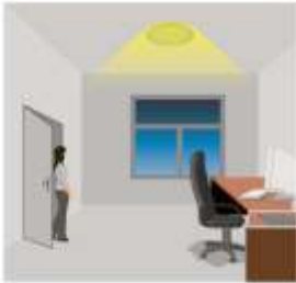
Light will turn on if any movement be detected in detection area.