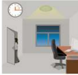
Light will dim to 10%/20%/30%/50%(options) after the hold time when no movement in detection area