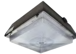
Low Profile (SGSAL series)