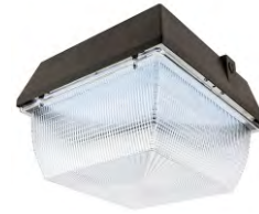
High Profile (SGSAH series)