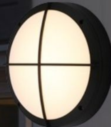
WRE SERIE (+ Grid)