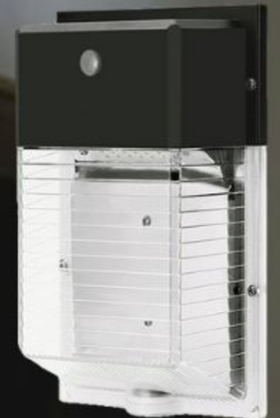
LT-WP02-S (Rectangle Profile)