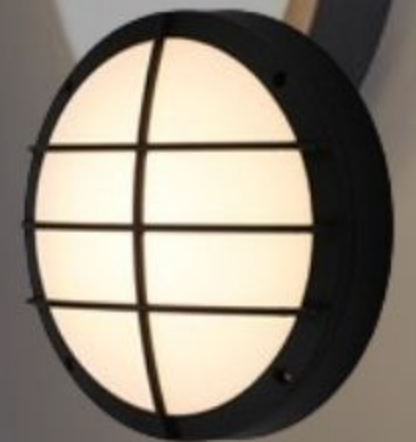
WRD SERIE (# Grid)